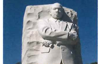
Martin Luther King, Jr. National Memorial