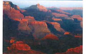
View the spectacular Grand Canyon