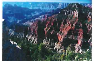
Experience the majestic scenery