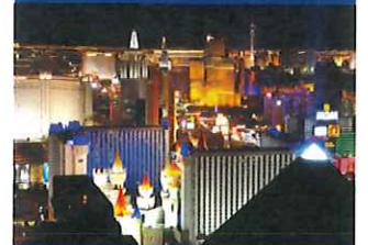
The world-famous Las Vegas Strip